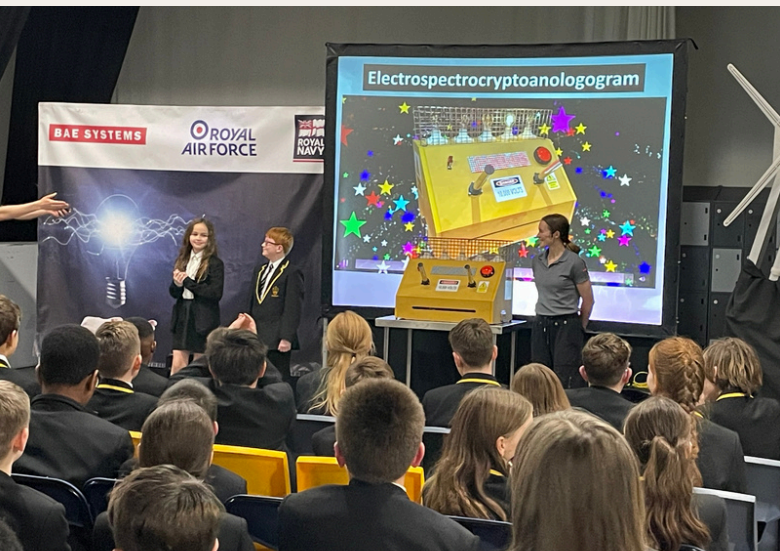
BAE Systems Roadshow in Partnership with the RAF and Royal Navy

Our Personal Development Programme keeps growing — here are some highlights coming soon