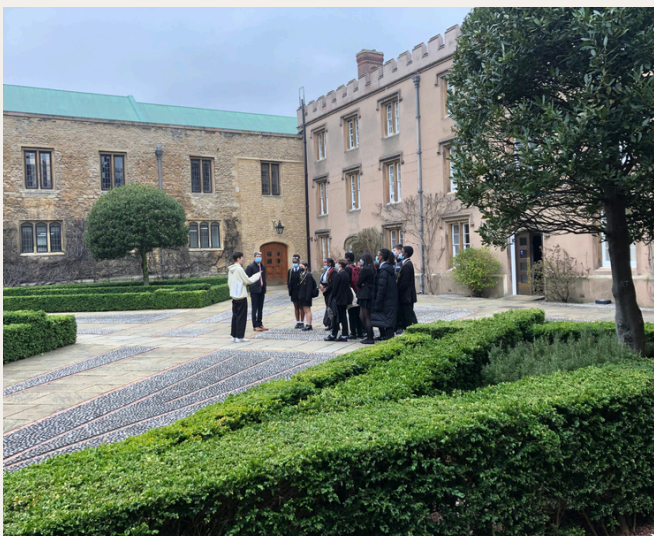
Emmanuel College Cambridge