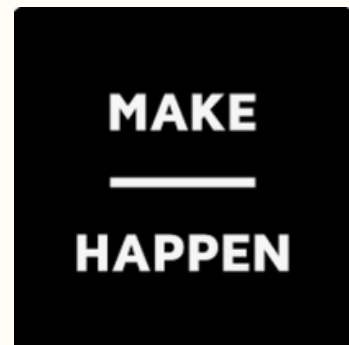
Year 9 Future Thinking Group