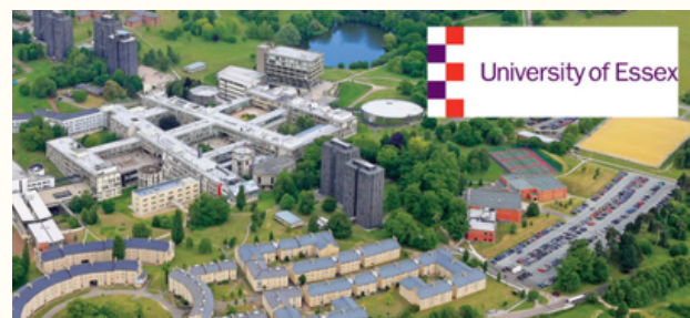
Year 9 Essex University Visit