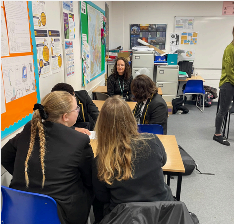
DWP & MINISTRY OF JUSTICE

I attended a session about insurance. It was my third session of the day. It was the best because they explained what it was and what you do in their job. It was very engaging, and it was very well presented. We played a spot the difference game, looking at differences between cars.