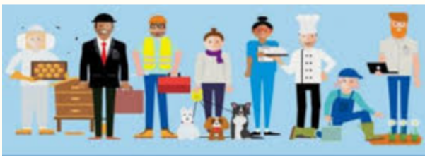
Year 10 Work Experience