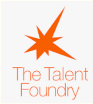
Year 8 Enterprise Challenge